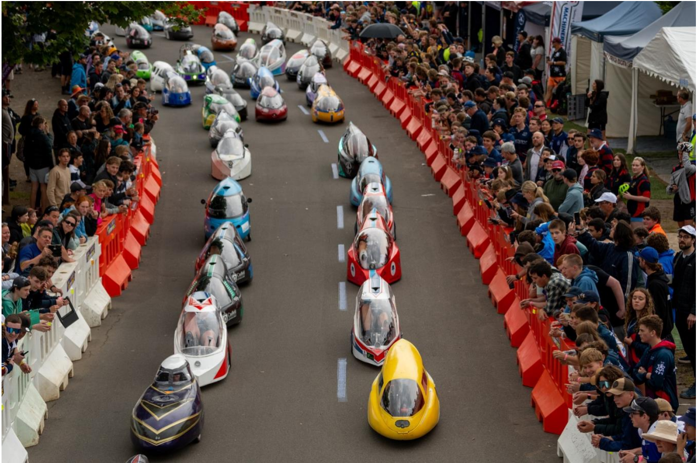
Above: The start of the 24 Hour HPV Secondary and Energy Efficient Vehicle Trial.

Each category has a specific 'Handbook' that covers the vehicle, cart or creations specification and Trials details.